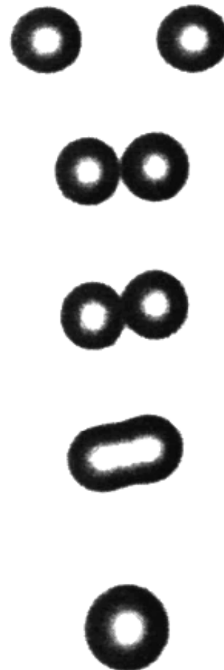
Glancing collision between two droplets in an axisymmetric extensional flow leading to coalescence